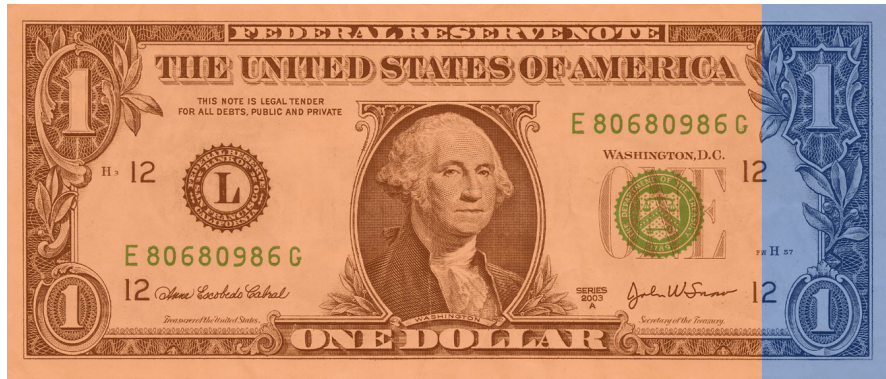
*rounded to the nearest cent for clarity.

We use 92 cents for Regional Economic Development , including advocacy, workforce development, business attraction, retention and expansion.