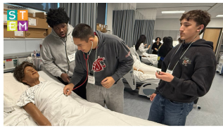
Connecting students to the careers that power our region.